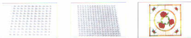
Glozell, Clear Prismatic and Lead Lighting diffusers. Lead Light available in limited designs.

What is the difference between Glozell and Clear Prismatic light Diffusers? The Glozell (ventilated) is an egg crate style diffuser, finishing the light shaft at ceiling level without obstructing the ventilation. Clear prismatic (unvented) diffusers consist of myriads of clear prisms which diffuse the light evenly over a wide area.